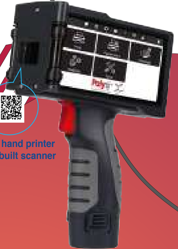
Mobile hand printer with inbuilt scanner